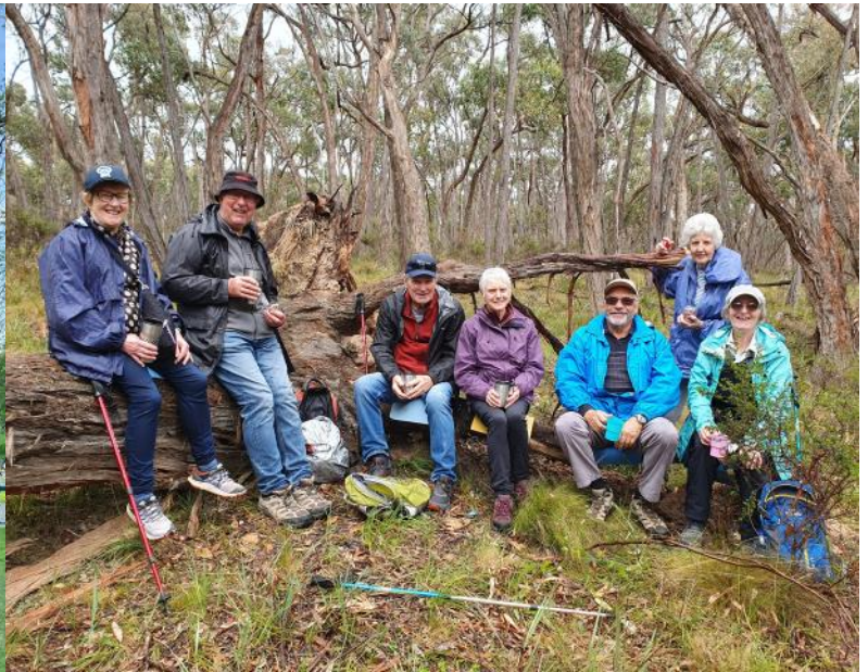
Some of the group on a new walk through the very pleasant open bushland of the Trawalla State Forest (east side of the Beaufort - Carngham Road).