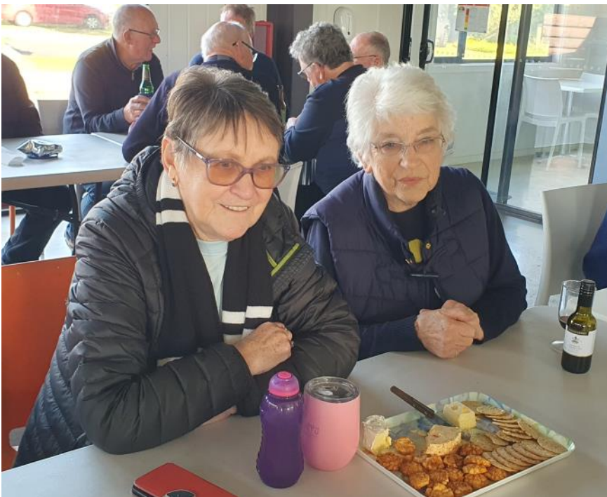
Camping and caravan— cont .....