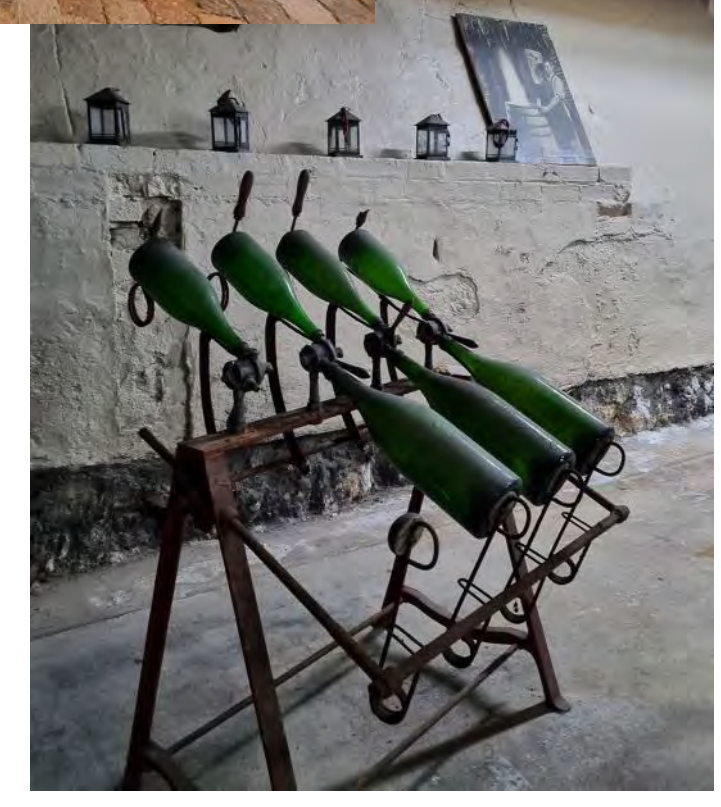
'Riddling' (hand turning of bottles for 6 weeks) process was also demonstrated.

Lunch after the meeting—Thursday 12 October at Park Hotel, 1615 Sturt St at 12 noon.