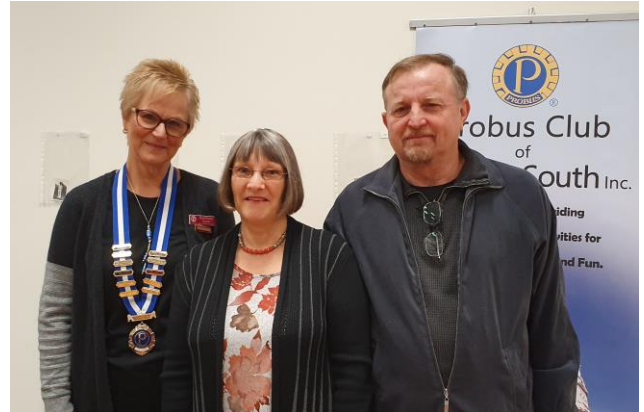
Induction of new members